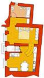
42 m 2 (2 places)

La Palazzina 1 is a small cozy apartment located on the Ground Floor of a building in the center of the borough. The apartment is composed of a living room, a well equipped kitchen area, 1 master bedroom and a bathroom with shower. Although it does not have a private garden, our guest can relax in the common landscaped garden areas of Borgo Gaggioleto with its magnificent swimming pool and massaging pool located in a panoramic position with a breathtaking view.